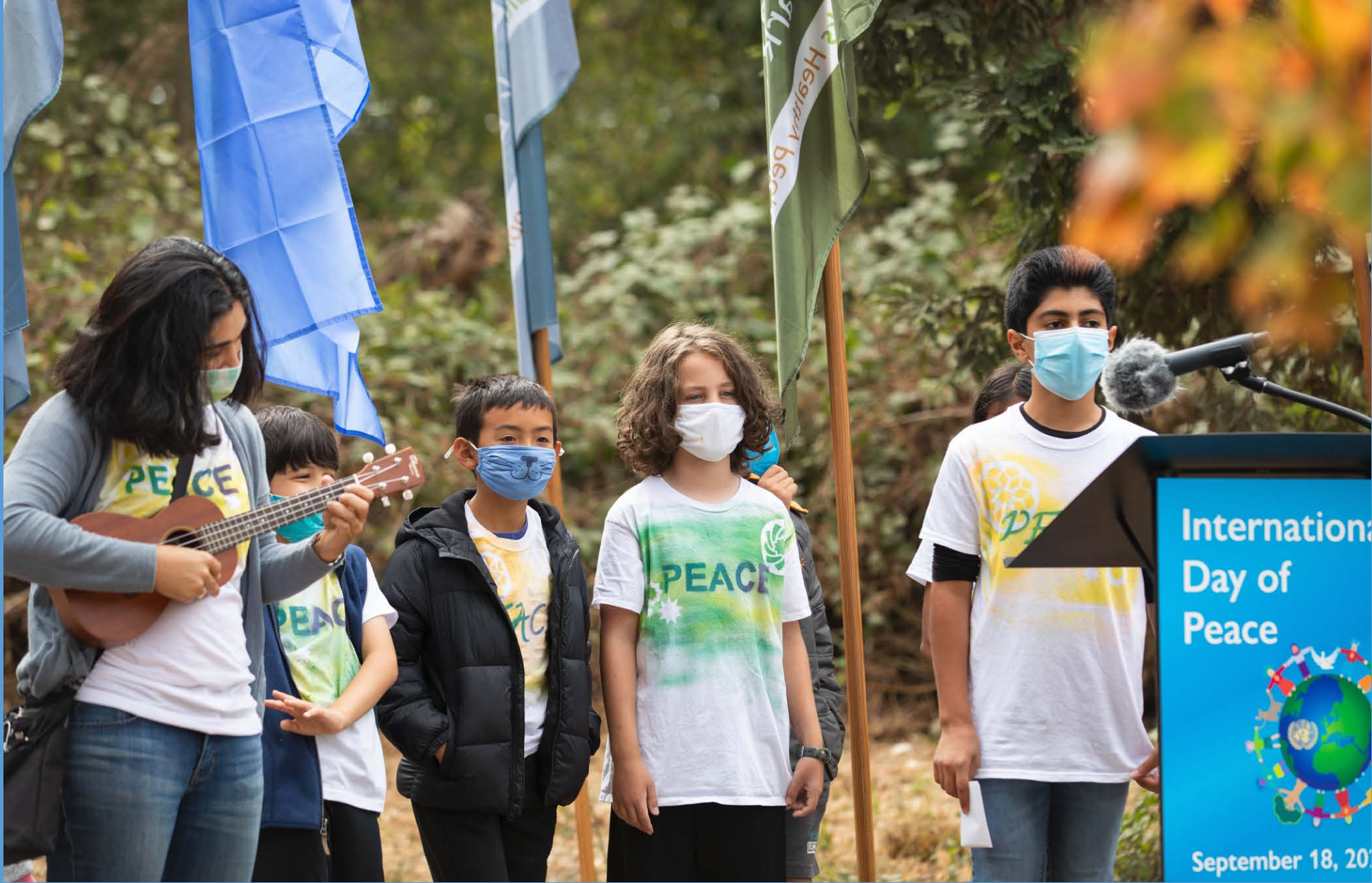
Peace Song: Baha'i Castro Valley