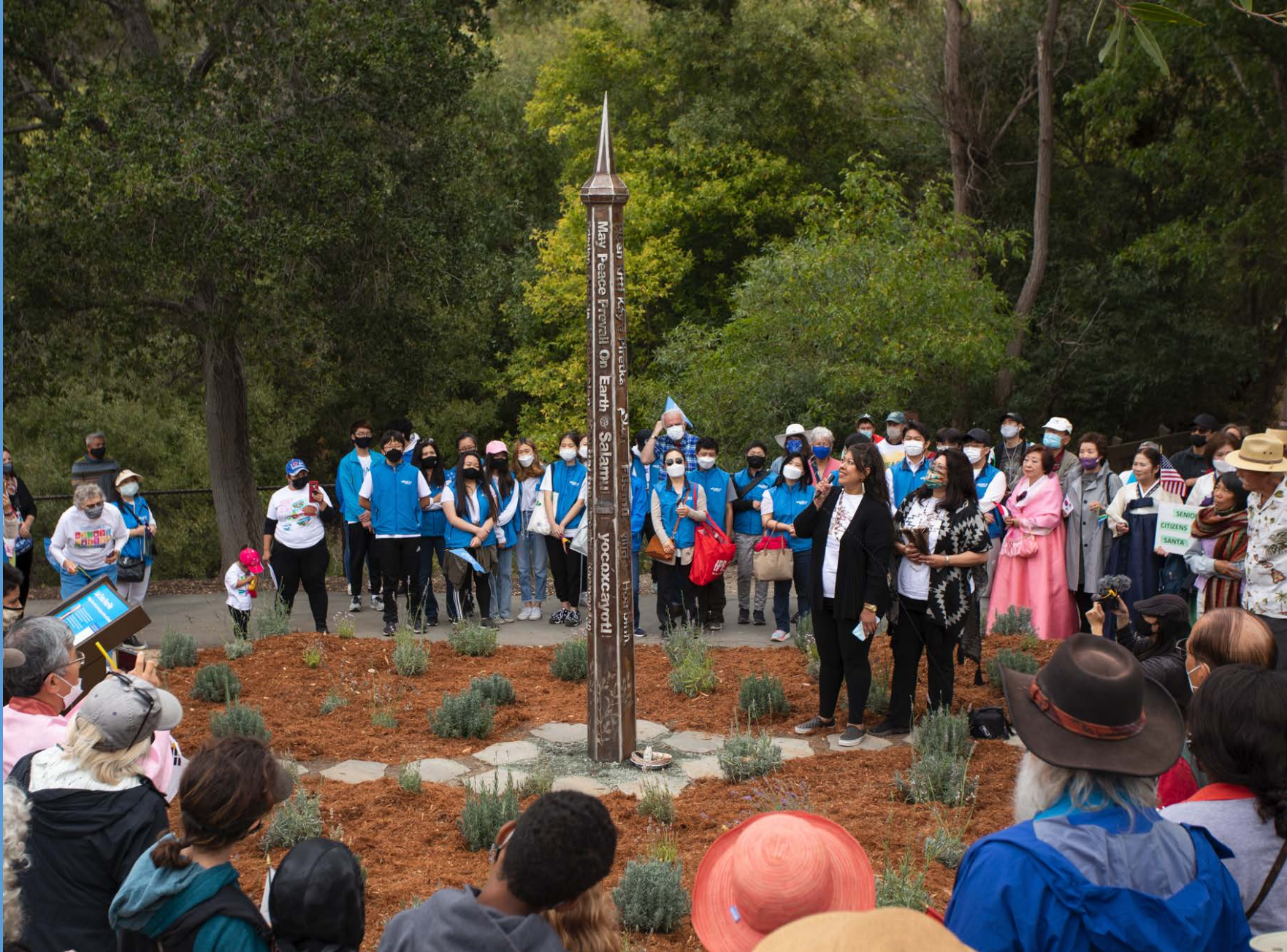
May Peace Prevail on Earth in Chochenyo: Píšen Kítiti Káy'e Piretka